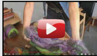
Carding and spinning