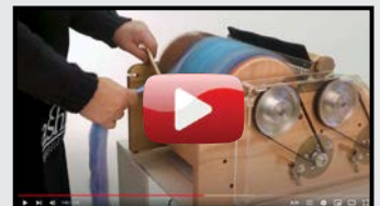
Ashford Diz Stick

www.youtube.com/user/AshfordHandicrafts/videos