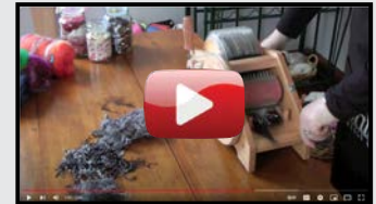
Carding on the Wild Carder